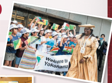
Children welcoming guests at TICAD 7