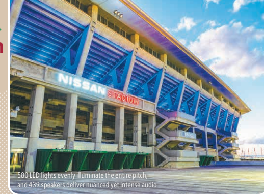
580 LED lights evenly illuminate the entire pitch, and 439 speakers deliver nuanced yet intense audio