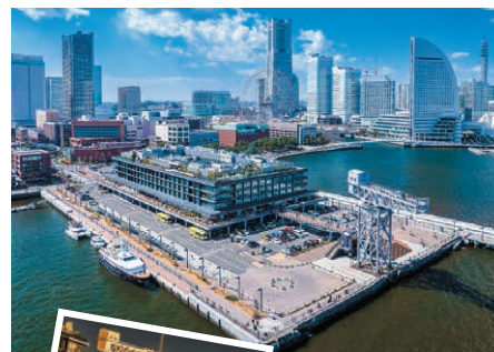
Surrounded on three sides by the ocean for a beautiful seaside view

2-14-1 Shinko, Naka-ku, Yokohama ☎ 045-211-8080 🕒 11:00 a.m. - 10:00 p.m., weekends and holidays: 10:00 a.m. - 10:00 p.m. (differs depending on the shop) 🗓 Irregular holidays 📍 10 minutes on foot from Bashamichi Station on the Minatomirai Line 🌐 https://www.hammerhead.co.jp/