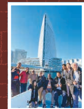
Port operations: JICA port security function improvement trainees (2024)