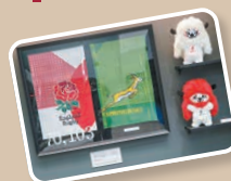
On the stadium tour, you can see mementos from the Rugby World Cup 2019™

With a seating capacity of nearly 72,000, this is one of the largest stadiums in Japan, and the home field of the J1 League Yokohama F. Marinos, and the Japan Rugby League One Yokohama Canon Eagles. The Rugby World Cup 2019™ championships were held here where the South African team won.