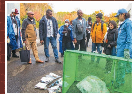
Waste management: Explanation of collection operations (2023)

Working together with the government, the Japan International Cooperation Agency (JICA), international organizations, and Yokohama businesses, the City of Yokohama promotes initiatives to contribute to growth in Africa across a variety of domains. Since it first dispatched a city worker to Kenya in FY1976, Yokohama has continued to provide waterworks support in countries across Africa. Leveraging its experience achieving a roughly 43% reduction in waste over 10 years starting in FY2001, the city provides regular waste management training to national and municipal workers in Africa via the African Clean Cities Platform (ACCP), which was co-founded by the Japanese Ministry of the Environment, JICA, African countries, and other parties. Yokohama also actively takes in trainees who want to learn about streamlining port logistics and operational management. As a city that achieved tremendous growth following the opening of its port to international trade in 1859, Yokohama possesses technologies and expertise that can be put to good use in rapidly growing African cities.