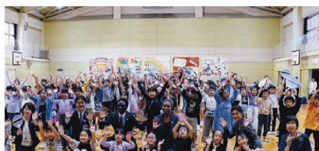
Online Tsuzuki-Botswana gathering