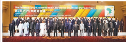
TICAD 7 group photo