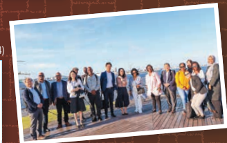
Port operations: Observers from African Union Development Agency (AUDA-NEPAD) (2024)