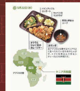
Kenyan home-styled dishes in junior high school lunches (2024)

With over 30 years since its inception, TICAD has served as an invaluable international conference on green growth and working toward SDGs. As the host city of TICAD 9, Yokohama aims to further deepen ties with Africa through the conference, share its green efforts and decarbonization initiatives with the world, and contribute to achieving a zero carbon society. In addition to the above, GREEN×EXPO 2027, the International Horticultural Exposition, will be held in Yokohama in 2027. Based on the theme "Scenery of the Future for Happiness", this event will greet visitors with an incredible display of flowers and greenery, and showcase green technologies that will lead us to a new society as we currently face planetwide issues such as climate change and the loss of biodiversity.