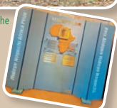
Monument bearing the nameplates of past awardees of the Hideyo Noguchi Africa Prize

An international restaurant with a view of the port