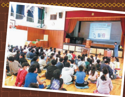
Former JICA Japan Overseas Cooperation Volunteer talking about Egypt (Kosugaya Elementary School) (2023)

Opportunities for exchange between African nations and city elementary and junior high schools are ongoing, with classes provided by former Japan Overseas Cooperation Volunteers and online gatherings. To date, over 200 elementary and junior high schools have participated in these programs. Since FY2023, African dishes have been served in junior high school lunches, proving to be a popular way to get to know Africa. "Student Project Connecting Yokohama to Africa" is part of the preparations for TICAD 9 in August 2025. Passionate students who took the initiative to sign up for this project will be working together as a group for six months, then will present their results in a video. Offering children and youth the opportunity to experience different cultures as part of their everyday lives not only gives them an international perspective, but it also helps diversify their values.