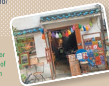
The exciting exterior evokes the feeling of going on an African journey