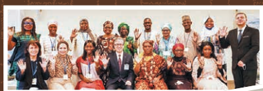
Japan-Africa Businesswoman Exchange Program (2023)