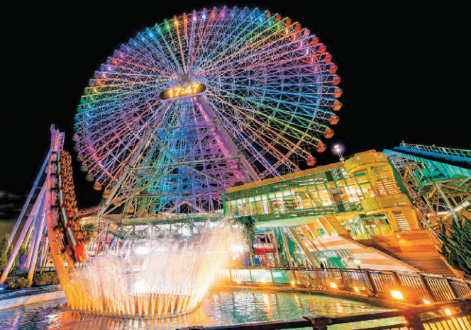
The beautiful lights of Cosmo Clock 21, a giant Ferris wheel

2-8-1 Shinko, Naka-ku, Yokohama ☎ 045-641-6591 🕒 11:00 a.m. - 8:00 p.m., weekends and holidays: 11:00 a.m. - 10:00 p.m. (ride cutoff time may end early when crowded) 🗓 Thursdays 📍 2 minutes on foot from Minatomirai Station on the Minatomirai Line 🌐 http://cosmoworld.jp