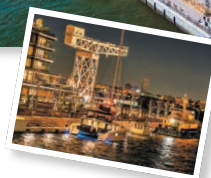
The dynamic illuminated Hammerhead Crane

Enjoy panoramic views of the city from the air!