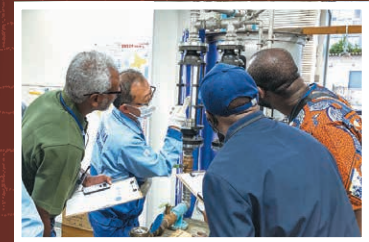
Waterworks: Training of African engineers in Yokohama (2024)