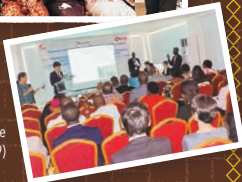
Seminar in Côte d'Ivoire (2019)