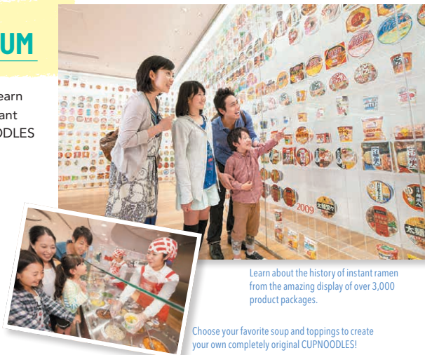
Learn about the history of instant ramen from the amazing display of over 3,000 product packages.

2-3-4 Shinko, Naka-ku, Yokohama ☎ 045-345-0918 🕒 10:00 a.m. - 6:00 p.m. (final entry: 5:00 p.m.) 🗓 Tuesdays (Closed the following day when Tuesday falls on a holiday) 📍 8 minutes on foot from Minatomirai Station or Bashamichi Station on the Minatomirai Line 🌐 https://www.cupnoodles-museum.jp/en/yokohama/