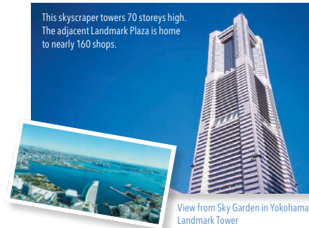
View from Sky Garden in Yokohama Landmark Tower

This skyscraper towers 70 storeys high. The adjacent Landmark Plaza is home to nearly 160 shops.