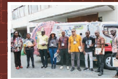
Waste management: Visit to the collection office (2023)