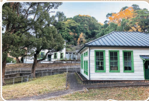
Nagahama Hall (left) and the former bacteriology laboratory (right)

As "the closest city to Africa" in Japan, Yokohama has a strong connection with the continent, and there are many areas within the city where you can find African culture.