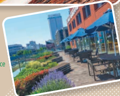
View from the Port Terrace Cafe

The site of three historic international victories