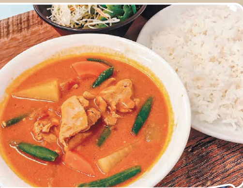
Ghanaian chicken, tomato, and peanut stew