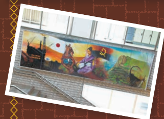
This giant murals at Center Kita Station were created and gifted to Japan by the Republic of Angola as a symbol of friendship