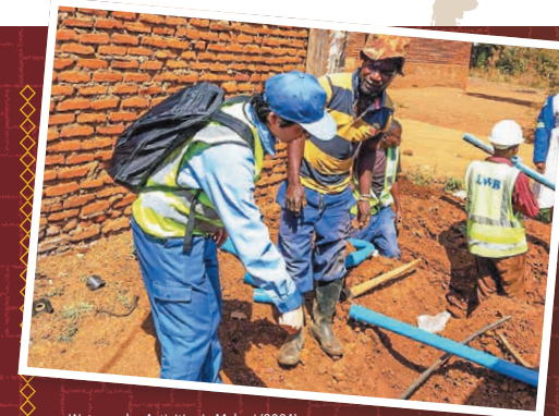
Waterworks: Activities in Malawi (2024)